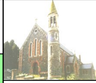
Our Lady of Lourdes

Follow us on-line at www.carrickparish.org