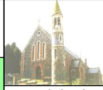
Our Lady of Lourdes

Follow us on-line at www.carrickparish.org